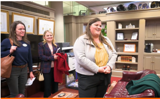
Staff Participate in Texas Recreation & Park Society 'Walk the Halls' at State Capitol during 88th Session